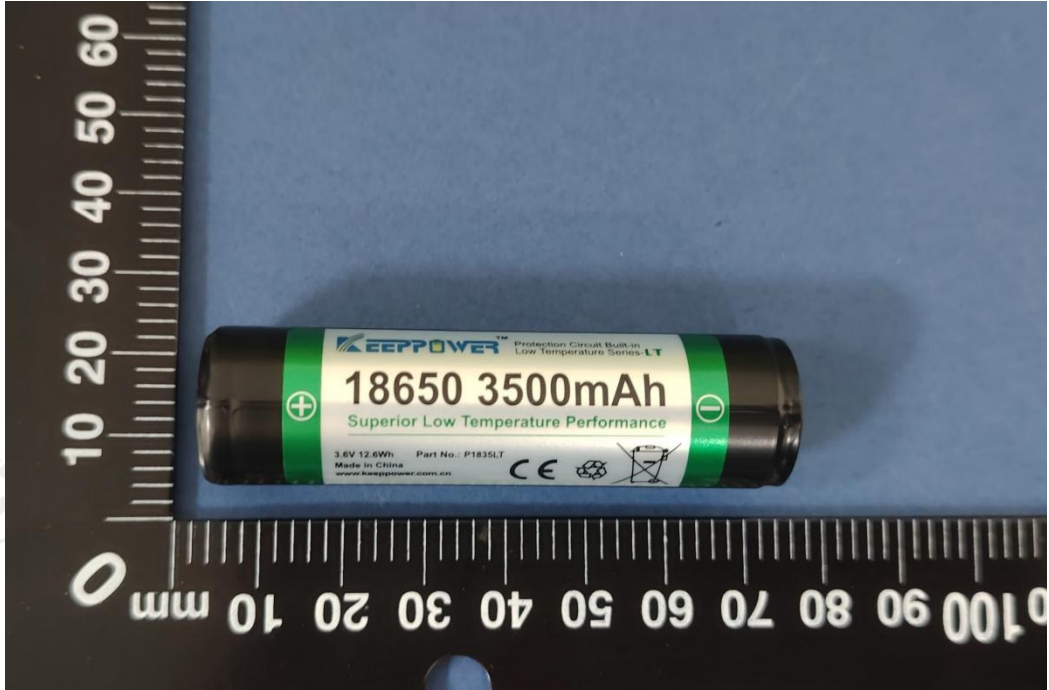
Picture 1. Front view of battery 图片 1. 电池组前视图